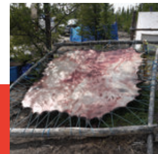
Traditional Knowledge Studies