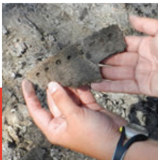
Controlled Artifact Collection