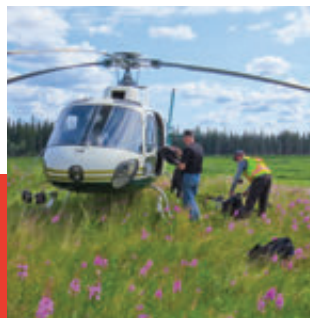
Accessing Remote Locations